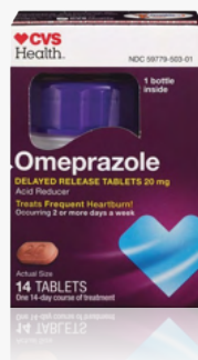
Omeprazole Tablets 14 CT, Sku 451300 $10.00