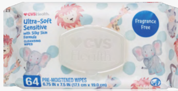
Unscented Wipes 64 CT, Sku 571810 $3.00