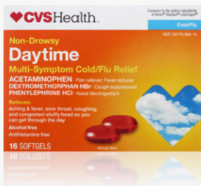
Daytime Cold/Flu Soft Gels 16 CT, Sku 890425 $6.00