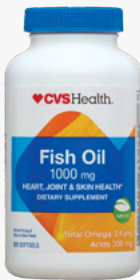
Fish Oil Omega-3 1000mg 120 CT, Sku 460962 $10.00