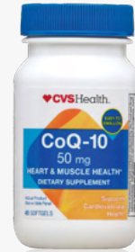
Coenzyme Q-10 50mg 45 CT, Sku 122869 $12.00