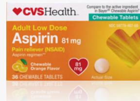
Chewable Aspirin 81mg 36 CT, Sku 547802 $2.00