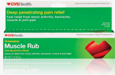
Muscle Rub 3 OZ, Sku 200964 $7.00