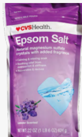
Epsom Salt 22 OZ, Sku 482649 $5.00