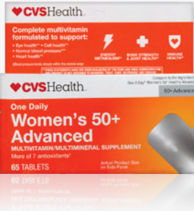
Adult Daily Women's 50+ 65 CT, Sku 448393 $8.00