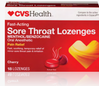
Sore Throat Lozenges 18 CT, Sku 707032 $4.00