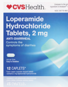
Anti-Diarrheal Tablets 12 CT, Sku 672550 $6.00