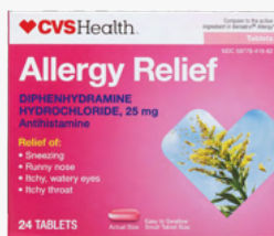
Allergy Relief Tablets 24 CT, Sku 477066 $4.00