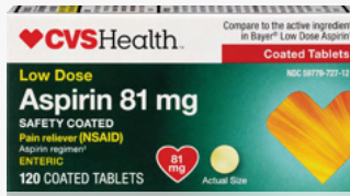
Enteric Aspirin 81mg 120 CT, Sku 230268 $5.00