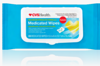
Hemorrhoidal Wipes 48 CT, Sku 401472 $6.00