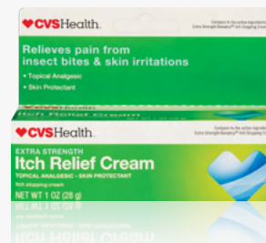
Anti Itch Cream 1 OZ, Sku 550749 $5.00