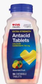
Antacid Tablets 96 CT, Sku 836320 $5.00