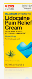
Lidocaine Cream 2.7 OZ, Sku 977934 $7.00