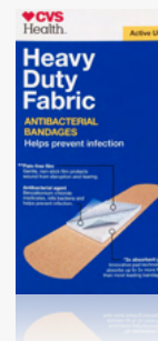
Heavy Duty Fabric Bandages 20 CT, Sku 875957 $4.00