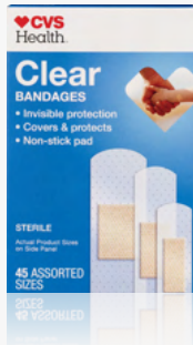
Clear Bandages 45 CT, Sku 383505 $4.00