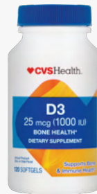
Vitamin D3 1000 IU 120 CT, Sku 346754 $7.00