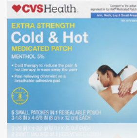
Hot/Cold Patches 5 CT, Sku 957604 $6.00