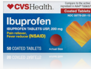
Ibuprofen 200mg 50 CT, Sku 371948 $4.00