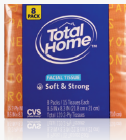
Facial Tissue 8 PK, Sku 265212 $2.00