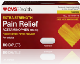
Acetaminophen 500mg 100 CT, Sku 371914 $7.00