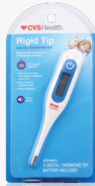
Digital Thermometer 1 CT, Sku 155912 $8.00