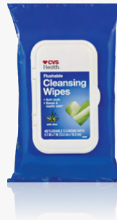
Flushable Wipes 42 CT, Sku 843837 $4.00