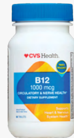
B-12 1000mcg 60 CT, Sku 247321 $7.00