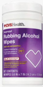
Rubbing Alcohol Wipes 40 CT, Sku 444797 $5.00