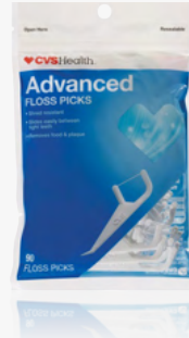
Flosser Picks 90 CT, Sku 454381 $3.00