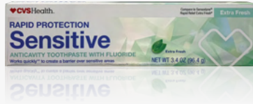
Sensitive Toothpaste 3.4 OZ, Sku 368775 $4.00