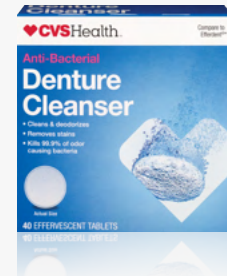
Denture Cleanser Tabs 40 CT, Sku 213330 $3.00