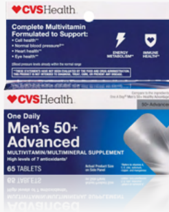
Adult Daily Men's 50+ 65 CT, Sku 448404 $8.00