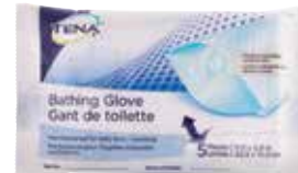
Bathing Wipes Item No. 2010 $8 00