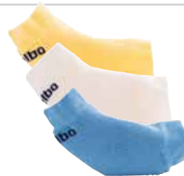
Heel & Elbow Protector