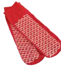
Slipper Socks, One Size Fits Most