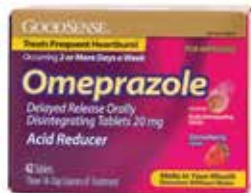
Omeprazole (Acid Reducer, Delayed Release, Dissolvable) Item No. 1966