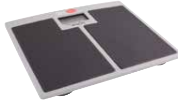
Bathroom Scale, Talking #8 Item No. 1981 $57 00 - 1 ct