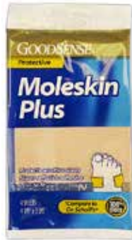
Moleskin Sheets Plus Item No. 1782 $6 00