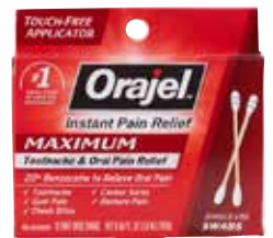
Sore Mouth Swabs, Orajel® Medicated Item No. 1888