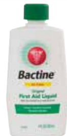
Bactine® Solution Item No. 1142