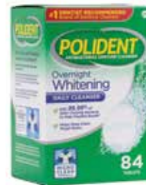
Polident® Overnight Item No. 1892