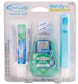
Dental Travel Kit Item No. 1749