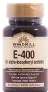
Vitamin E, Soft Gels, Natural † Item No. 2086