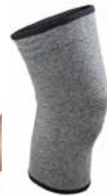
Arthritis Knee Sleeve • Small Item No. 2011 • Medium Item No. 2012 • Large Item No. 2013 • X-Large Item No. 2014