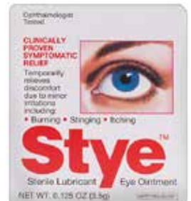
Eye Ointment, Stye® Item No. 1906