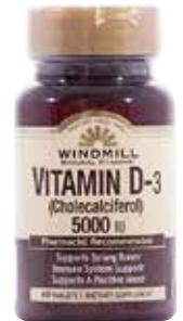
Vitamin D3, Natural † Item No. 2078