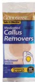
Callus Remover Pads Item No. 1238