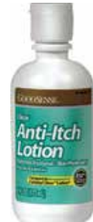
Caldyphen Clear (Anti-Itch Lotion)