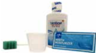
Oral Care System Kit Item No. 1750