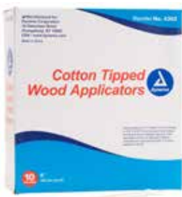
Cotton Tipped Applicator - 6" Item No. 1669