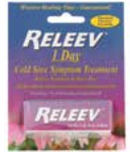
Releev® Cold Sore Treatment Item No. 1359