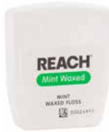
Dental Floss, Reach® Waxed - Mint Item No. 1455