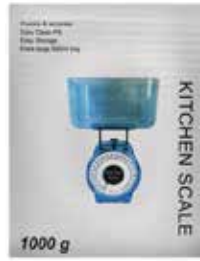
Scale, Kitchen, Dial ‡ Item No. 1756