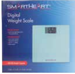
Bathroom Scale #8 Item No. 1935 $35 00 - 1 ct