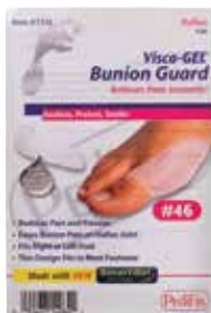
Bunion Guard Item No. 1784