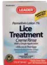
Lice Treatment Rinse (Permethrin) Item No. 1269