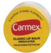
Carmex® Item No. 1255