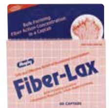
Fiber Tablets ‡ Item No. 1155