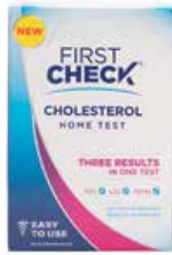
Home Access Cholesterol Test † Item No. 1251