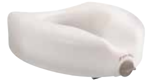
Toilet Seat, Raised Item No. 1729