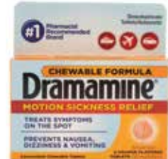
Dramamine® Chewables, Orange Item No. 1264