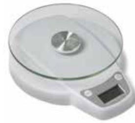
Scale, Kitchen, Digital ‡ Item No. 2016