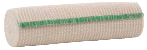
Bandage, Elastic - 6" x 5 yd Item No. 1213