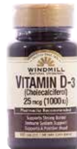
Vitamin D3, Natural † Item No. 2077