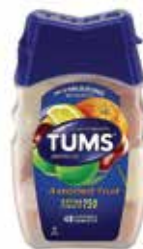
TUMS® Extra Strength Item No. 2034