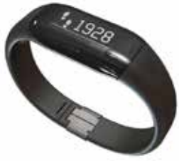
Activity Tracker Item No. 1982 $52 00 - 1 ct