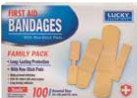
Adhesive Bandages Item No. 1344