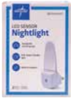
Night Light Item No. 1983