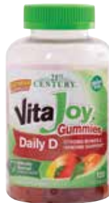
Vitamin D3, Gummy † Item No. 1978