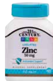
Zinc, Chelated † Item No. 1419