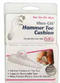
Hammer Toe Crest Item No. 1785