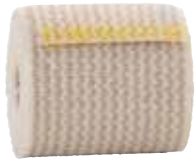
Bandage, Elastic - 2" x 4.5 yd Item No. 1207