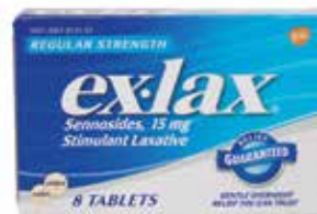
Ex-Lax® Item No. 1124