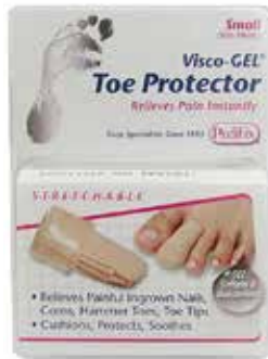
Toe Protector, Small Item No. 1788 $9 00