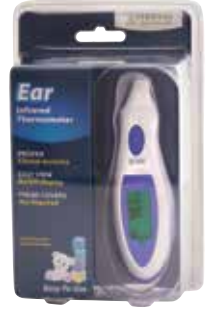
Thermometer, Digital Ear Item No. 1285 $30 00 - 1 ct