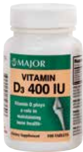
Vitamin D3 † Item No. 1383