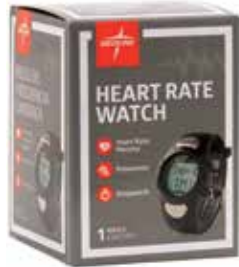
Heart Rate Monitor Watch # Item No. 1771 $40 00 - 1 ct