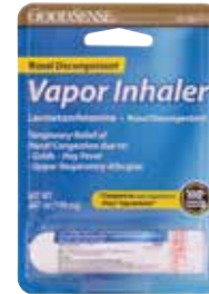
Nasal Decongestant Inhaler - Levmetamfetamine Item No. 1922