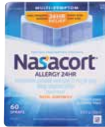
Nasacort® Item No. 1881

- Compare to Benadryl® Children's Allergy Liquid - .4 oz/1 mg, 5 ml; 3 mg, 5 ml