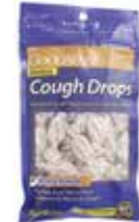
Cough Drops, Menthol