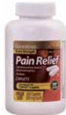
Acetaminophen (Pain Reliever, Extra Strength) Item No. 2002