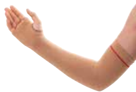
Arm Sleeve, Protective - Small Item 1897