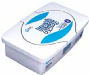
Flushable Wipes Item No. 2000 $12 00