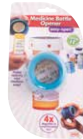
Medicine Bottle Opener with Magnifier Item No. 2017