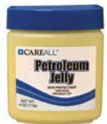
Petroleum Jelly Item No. 2018