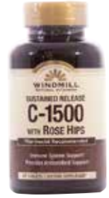
Vitamin C, with Rose Hips, Natural † Item No. 2085