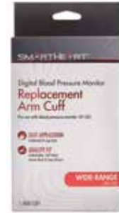
Blood Pressure Monitor, Desktop Replacement Cuff # Item No. 1504 $15 00 - 1 ct