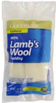
Lamb's Wool Padding Item No. 1786 $6 50