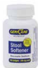
Docusate Sodium (Stool Softener) Item No. 1126