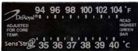
Thermometer, Fever Strip Item No. 1794 $8 00 - 1 ct