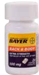
Bayer® Back & Body Pain, Extra Strength Item No. 1720