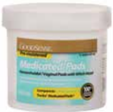
Pre-moist Hemorrhoid Pads Item No. 1364 $8 00