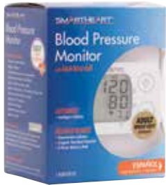
Blood Pressure Monitor, Wrist # Item No. 1501 $35 00 - 1 ct