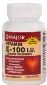
Vitamin E, Soft Gels † Item No. 1391