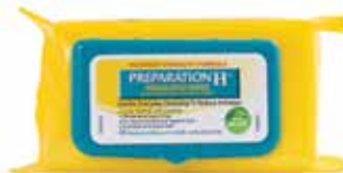
Preparation H® Medicated Wipes Item No. 1895 $13 00