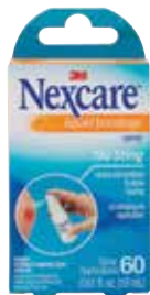
Liquid Bandage Item No. 1872