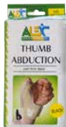
Thumb Brace Item No. 1778