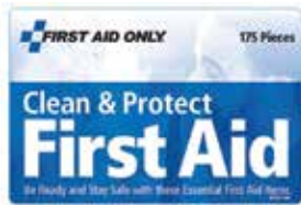
First Aid Kit, 175 Pieces Item No. 1738