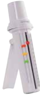
Peak Flow Meter # Item No. 1789 $17 00 - 1 ct