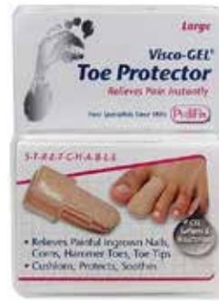
Toe Protector, Large Item No. 1787 $9 00