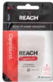
Dental Floss, Reach® Waxed - Cinnamon Item No. 1901