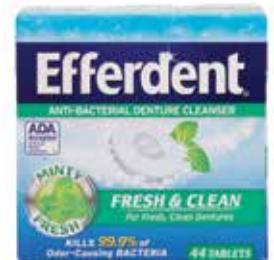
Efferdent® Plus Mint Tablets Item No. 1653