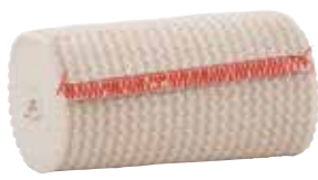
Bandage, Elastic - 3" x 5 yd Item No. 1209