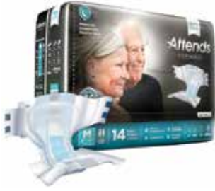
Premier® Adult Briefs, Medium - 32" to 44" Item No. 1993