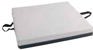
Cushion, Gel/Foam Seat Item No. 1466