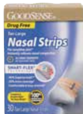
Nasal Strips, Large Item No. 1725