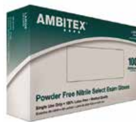
Nitrile Exam Gloves Item No. 1840