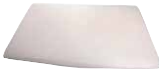
Mattress Cover, Elastic - 80" x 36" x 6" Item No. 1753