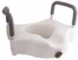
Toilet Seat, Raised, with Arms