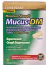
Mucus Relief DM Expectorant & Cough Suppressant, Extended Release