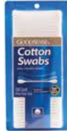
Cotton Tipped Swabs Item No. 1742