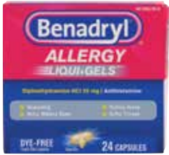
Benadryl® Allergy Liqui-Gels Dye-Free Item No. 1927