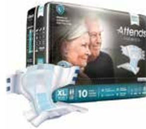
Premier® Adult Briefs, X-Large - 58" to 63" Item No. 1995