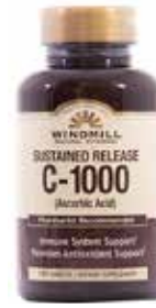
Vitamin C, Natural † Item No. 2084