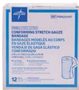
Bandages, Gauze Sterile, Conforming Stretch