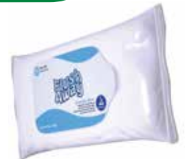
Flushable Wipes Item No. 1928 $7 50