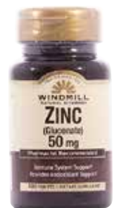
Zinc, Natural † Item No. 2090