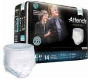
Premier® Disposable Underwear, X-Large - 56" to 68" Item No. 1992