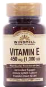
Vitamin E, Soft Gels, Natural † Item No. 2087