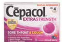
Sore Throat Lozenges, Cepacol®

- Compare to Vicks NyQuil® - 4 oz/12.5 mg, 30 mg, 650 mg