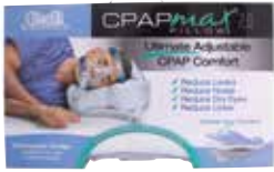
Pillow, CPAP, Memory Foam Item No. 1837