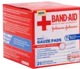
Gauze Pad, Johnson & Johnson® - 2" x 2" Item 1676