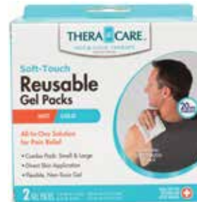
Hot/Cold Pack, 1 small & 1 large Item No. 1062