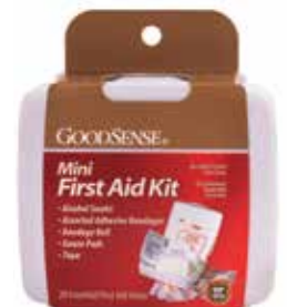
First Aid Kit, 20 Pieces Item No. 1947