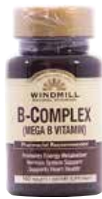
Vitamin B-Complex, Natural † Item No. 2079