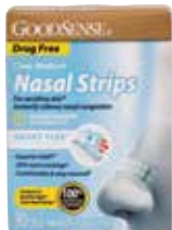
Nasal Strips, Medium Item No. 1724