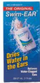
Ear Drops, Swim-Ear® Item No. 1910

- Compare to Johnson & Johnson® - 300 ct