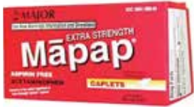
Acetaminophen (Pain Reliever, Extra Strength) Item No. 2030