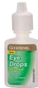
Eye Drops, Irritation Relief Item No. 1806