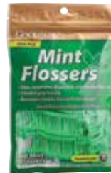
Interdental Flossups Item No. 1751