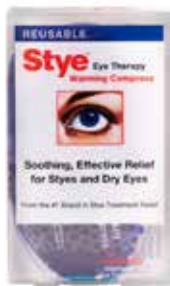
Eye Compress, Stye® Item No. 1905

- Compare to Renu® Multipurpose Solution - 12 oz