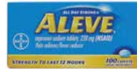
Aleve® Item No. 1104