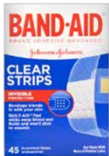
Bandages, Band-Aid® Clear Comfort-Flex, Assorted Sizes Item No. 1667