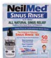
Nasal Rinse Kit, Saline

- Compare to Mucinex® - 14 ct/1,200 mg, 60 mg