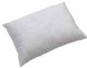
Pillow, Hypoallergenic Item No. 1936