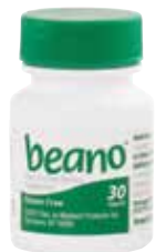
Beano® Item No. 1316