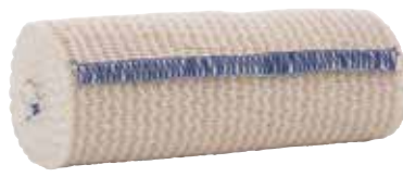
Bandage, Elastic - 4" x 5 yd Item No. 1211