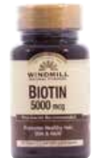
Biotin, Natural ‡ Item No. 2091