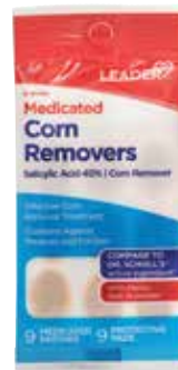
Corn Remover Pads Item No. 1236