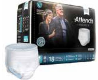
Premier® Disposable Underwear, Medium - 36" to 44" Item No. 1990