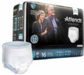
Premier® Disposable Underwear, Large - 44" to 58" Item No. 1991