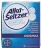
Alka-Seltzer® Item No. 1313