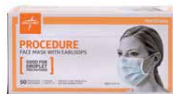
Face Masks, Procedural, with Earloops