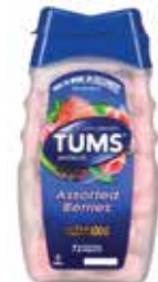
TUMS® Ultra Strength Item No. 2019