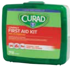
First Aid Kit, 75 Pieces Item No. 1215