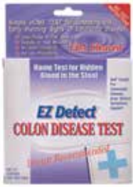
EZ Detect® Colon Cancer Test Kit † Item No. 1416