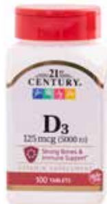
Vitamin D3 † Item No. 1973