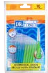
Interdental Gum Brushes Item No. 1748