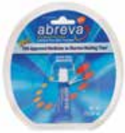
Abreva® Item No. 1152