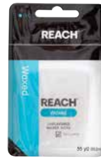
Dental Floss, Reach® Waxed - Unflavored Item No. 1902