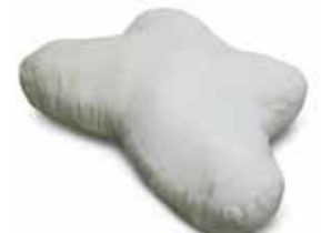
Pillow, CPAP, Fiber Filled Item No. 1836