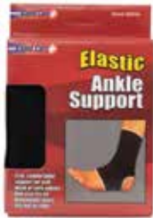
Ankle Support Item No. 1225