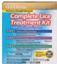
Lice Elimination Kit Item No. 1929