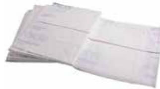
Underpad, Extra Absorbent Air Permeable, 30" x 36" Item No. 1996