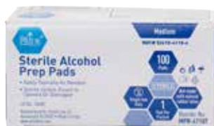
Alcohol Pads Item No. 1200

- Compare to Band-Aid® Plastic Strips - 60 ct