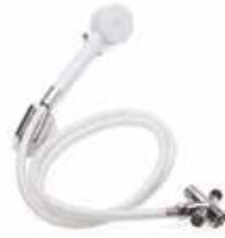
Shower Head, Handheld