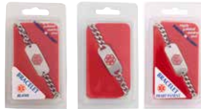
Medical ID Bracelet: