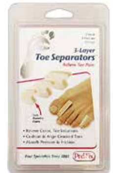
Toe Separator Item No. 1783 $7 00