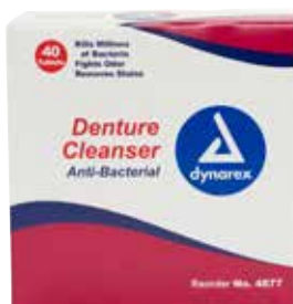
Denture Cleaning Tablets Item No. 1032