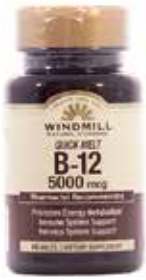
Vitamin B-12, Sublingual, Natural † Item No. 2083