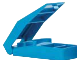
Pill Cutter with Safety Shield Item No. 1932