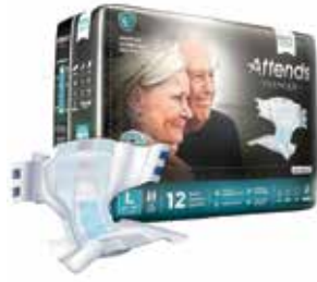
Premier® Adult Briefs, Large - 44" to 58" Item No. 1994